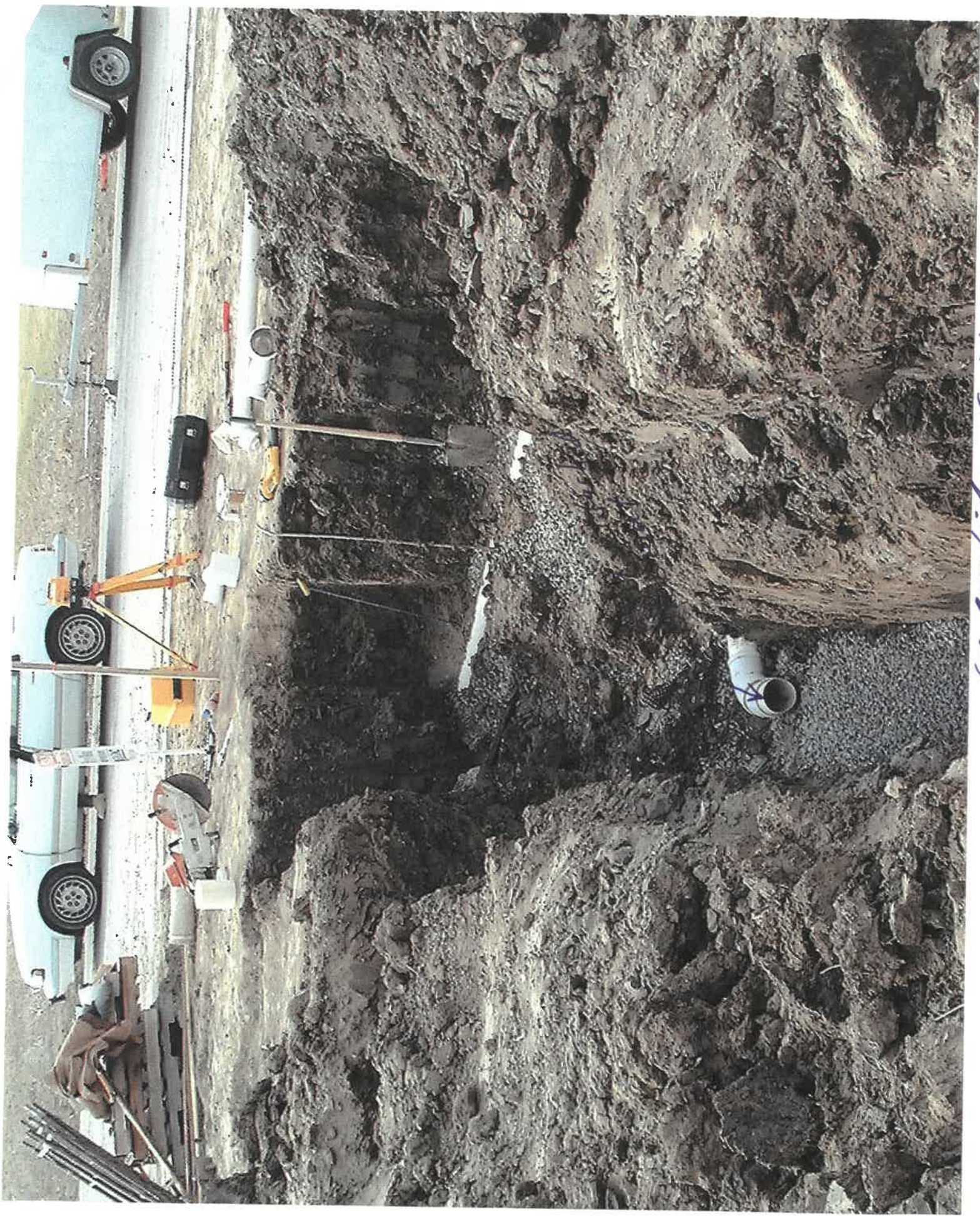
610 Cambridge Sewer